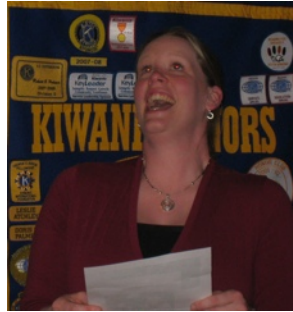
WOW! (It sunk in!)

organization advocates for abused children, and this is especially important for sexually abused children. She said 1 in 4 girls and 1 in 6 boys will be sexually abused by the age of 18 years nationally.