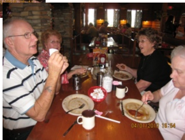
A good time for fellowship

Numbers indicate that we served Nearly 400 people. We had excellent participation from our members and from Flapjacks Pancake Cabin.